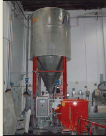
Silo where flocculation and particle separation occur. The red apparatus to the right is the filter press.