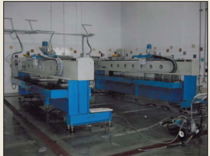
Remediated water is returned to the processing area and reused in such applications as the polishing stage pictured here.